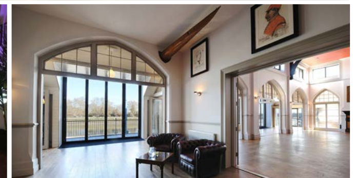
Adaptable Function Space